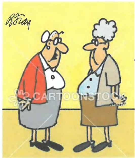
"I DON'T THINK OF MY SKIN AS SAGGY...I THINK OF IT AS RELAXED-FIT!"